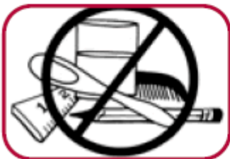
5. Don't put anything in mouth.