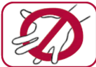
6. Don't hold down.