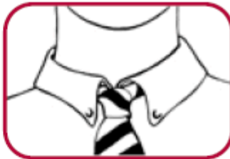
2. Loosen tight clothing.