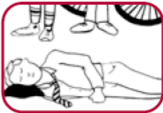
3. Turn on side and keep airway clear.