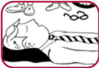
1. Cushion head, remove glasses.

To ensure my safety, here are some steps to follow: